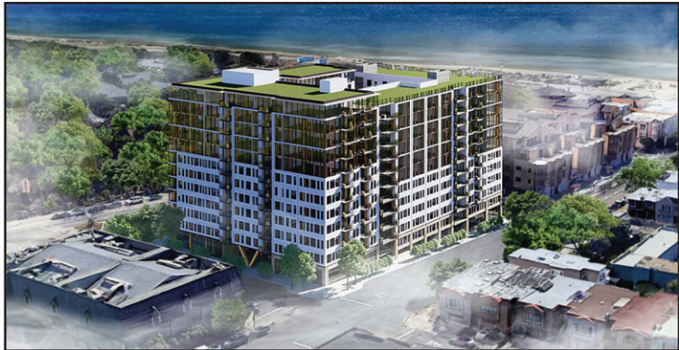
A birds-eye view looking southwest shows the proposed new 12 story multi-unit building, across the street from the UICC.

Many of you will be aware of our own ambitious plan for redeveloping our facility at 45th and Wawona. Less may be known about the recently proposed multi-unit residential and retail development across the street (to the west) where the Sloat Garden Center is currently housed. The site was sold in 2020 to a developer for $8.55 million, and last month we learned that the developers