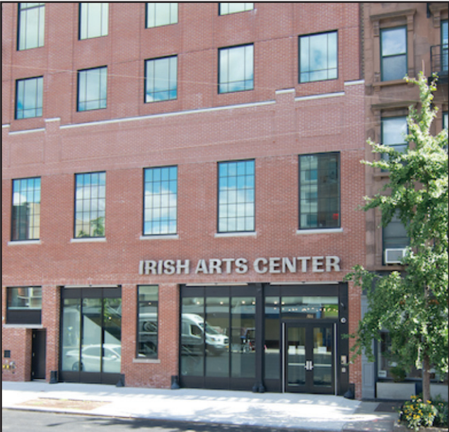
Exterior of the new $60 million New York Irish Arts building on the west side of New York at 726 11th Ave.