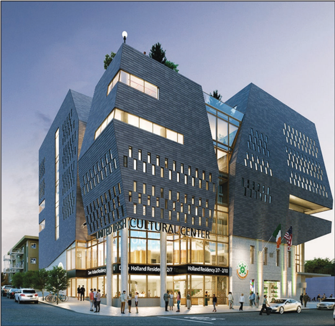
An artist's rendition of the new Irish Center as it will be seen from the corner of 45th Avenue and Wawona Street.